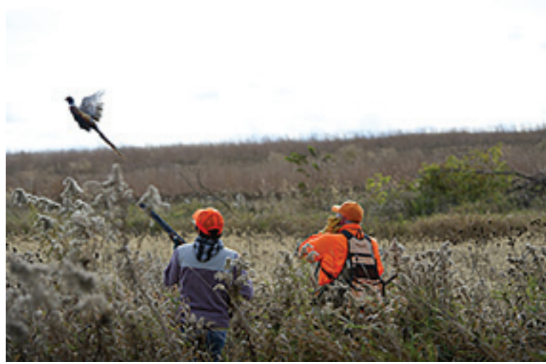
MDC will offer four separate classes during a one-day clinic highlighting the fundamentals of shotgun and handgun shooting. Courses are set for June 19, from 9 – 11 a.m., from noon – 1:30 p.m., from 2 - 3:30 p.m., and from 4 - 5:30 p.m. at Rolla Shooting Club in Rolla.

Beginner Handgun Class is designed for participants age 16 and older; those age 16 to 17 may participate with a parent or guardian who is