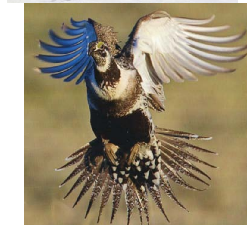
Greater Sage Grouse